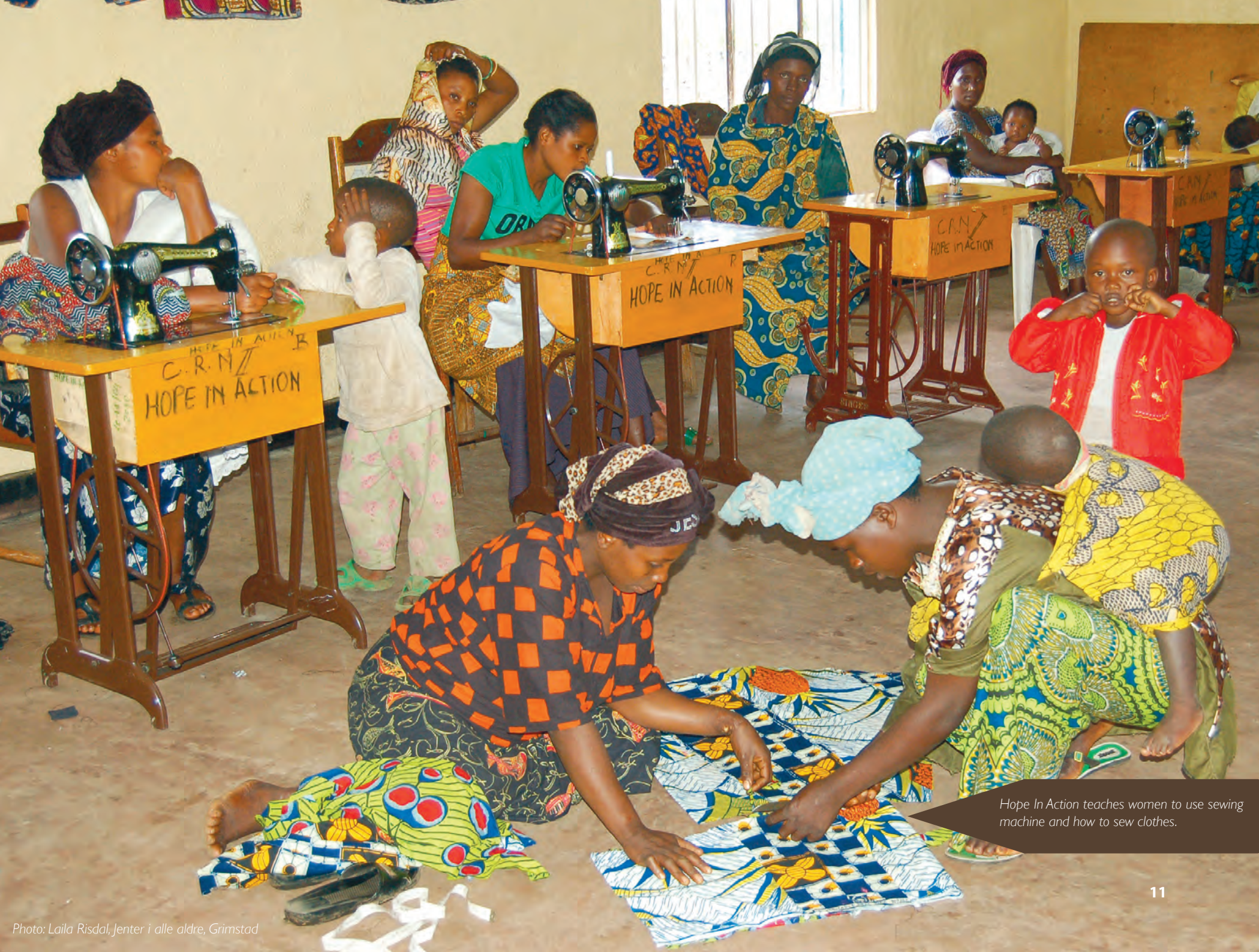
Hope In Action teaches women to use sewing machine and how to sew clothes.